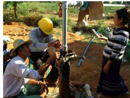
Training of Pumping Test