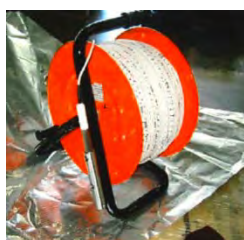
Water Level Indicator