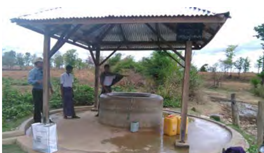
Traditional Water Source