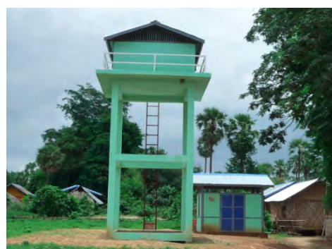
Improved Water Supply System