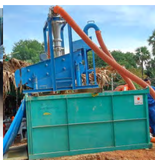
Sand Removing Equipment