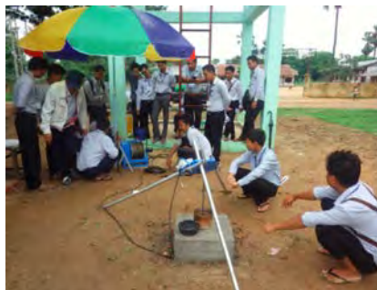
Training of Well Logging

<MANAGEMENT GUIDANCE (TECHNICAL TRANSFER)>