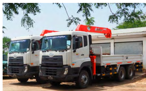
Cargo Truck with 5 ton Crane